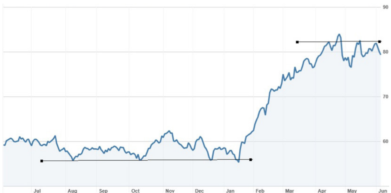
Chart 5: Macquarie Group 1 year price performance (AUD)

For illustrative purposes only.