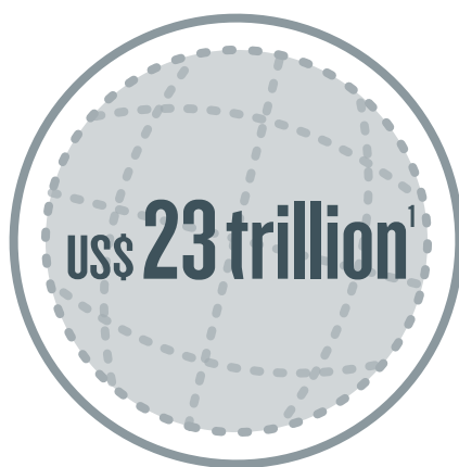
Value of globally held responsible investing assets

More investors are incorporating responsible investing into their investment strategy to better manage risk and identify new opportunities.