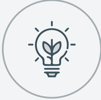
Sustainable business practices