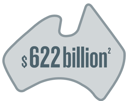
Value of domestically held responsible investing assets