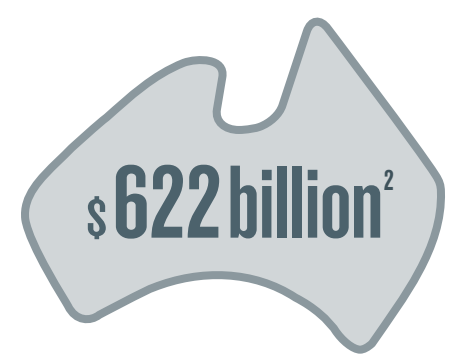
Value of domestically held responsible investing assets