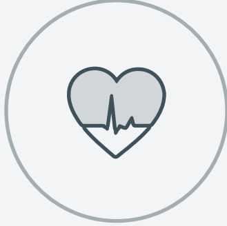
Healthcare & medical products